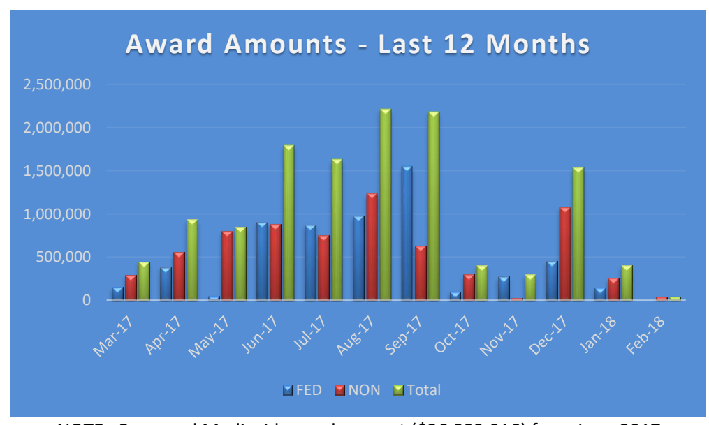
NOTE: Removed Medicaid award amount ($26,882,016) from June 2017