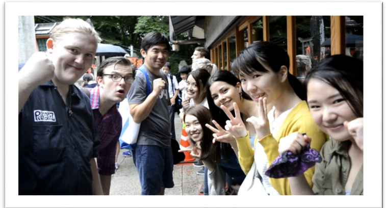
Climbing Mt. Inari with Tomodachi partners

Note: We have provided you with luggage tags with the dorm address on them. Be sure to use them in case a bag gets lost! If you are only checking one bag, put the second on your carry-on. It never hurts to have it.