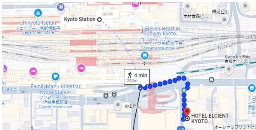
This is a map of the route you should take from Kyoto Station to the hotel.

The next morning, everyone will meet in the hotel lobby for 9:00AM and we will travel together to the Doshisha dorm.