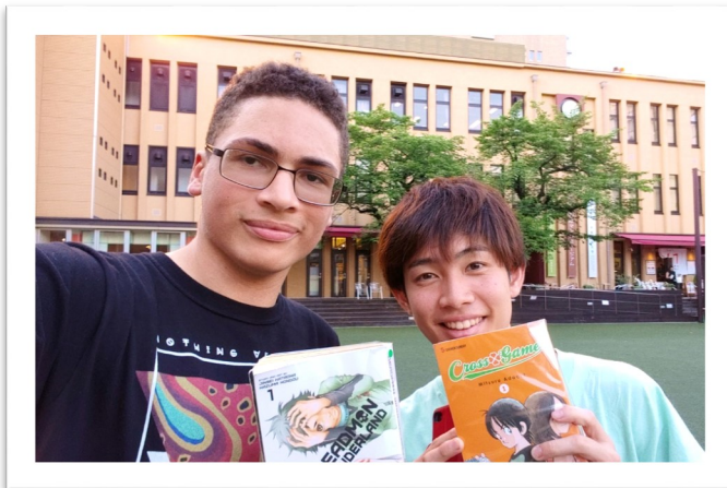
Tomodachi for life!