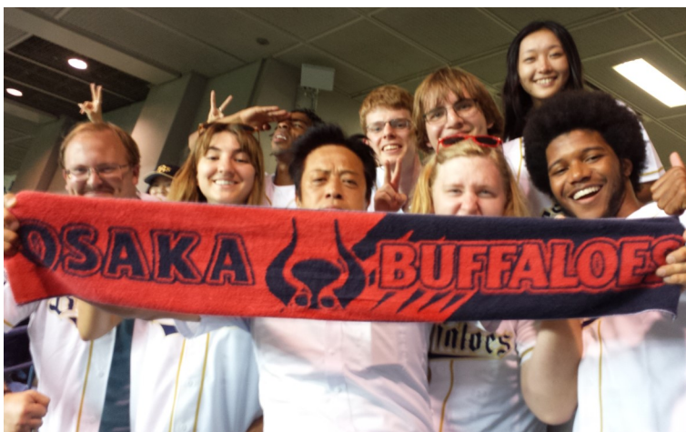
Enjoying a baseball game with local fans

However you do your traveling, we advise investing in a travel guide such as Let's Go: Japan and doing some planning ahead (Barnes & Noble has a great selection).