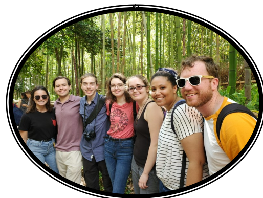
Students visiting the Bamboo Forest in Kyoto