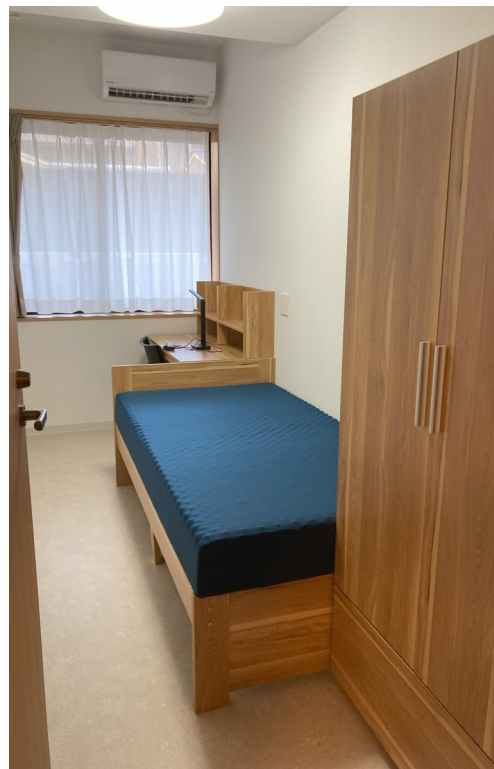
A typical room

HAIR DRYERS: There are hair dryers in the powder area.