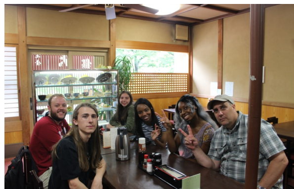
Lunch on the Kyoto field trip!

DINNER: You will usually be on your own for dinner. One of the pleasures of exploring a new country is sampling the local cuisine, and many Kyoto restaurant guides are available online. Be sure to try one of the "hole-in-the-wall" ramen noodle shops in the area. There is nothing like them in the US! An alternative to restaurants is to buy bread, rice balls, fruit, green tea, etc. at local stores and bakeries, and enjoy eating together at the Keishiryō . There is so much native culture and flavor to be found in local shopping markets that it would be a shame to miss out on this experience anyway. Also you can take advantage of the kitchen in the Keishiryō . It may help you save a few bucks!