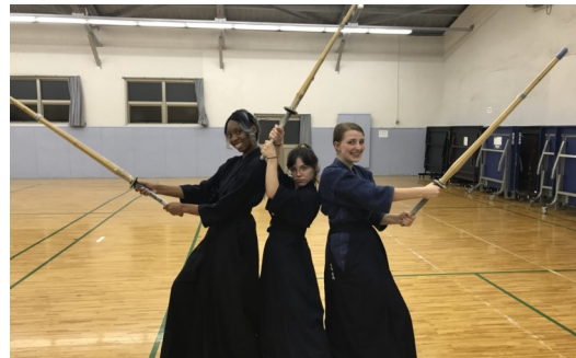
Martial arts afternoon activity