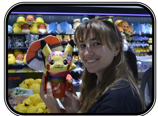
Finding a Pikachu at the Pokémon store

You should realize that anytime you travel abroad there is potential for danger due to crime, political unrest, unforeseen "Acts of God," strikes that will affect your travel plans. We simply cannot list every possible scenario in this pre-departure guide. Therefore, we recommend that if you have any concerns about traveling to a particular place, you contact the US Government Travel Advisory. This can be found on the Internet at: www.travel.state.gov/ .