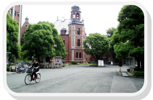
Exploring the Doshisha campus