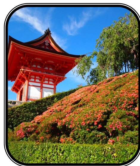
A pagoda at Fushimi Inari-taisha