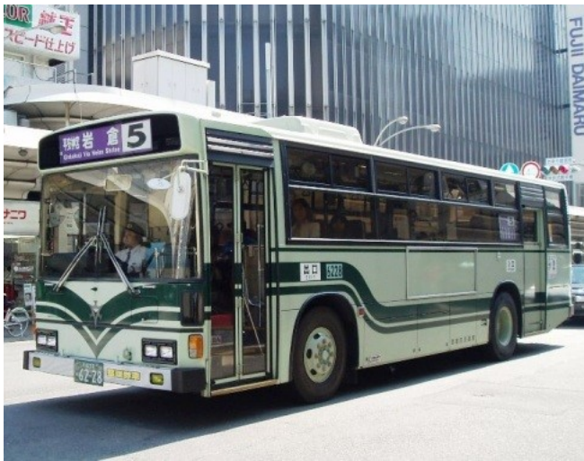
Kyoto City Bus (usually green)

PUBLIC TRANSPORTATION: Public transportation in Kyoto, as in most of Japan, is excellent. We encourage you to take advantage of it. The information packet you will receive upon arrival includes some public transit information, including a map for all the buses and subway lines for Kyoto and surrounding areas. Your city bus pass is good for most of the bus lines indicated on the map; however, certain surcharge will be assessed if you go past the city limit. Your pass is only good for Kyoto City busses, NOT for Kyoto busses.