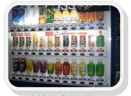
Drink Vending Machine

It is important to note that some Japanese laws and customs differ from those of the US. You must respect the laws of your host, or you risk tarnishing their views of American travelers and possibly risk a run-in with authorities. PLEASE remember this important concept.