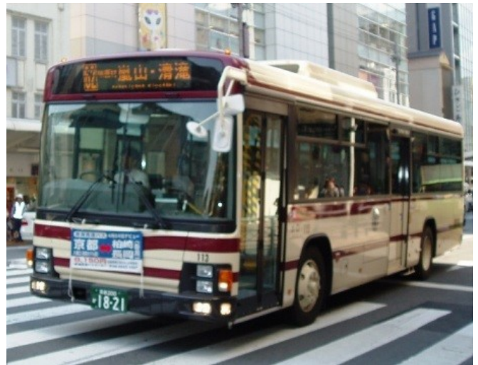
Kyoto Bus (usually maroon)

PEDESTRIAN PRECAUTIONS: It is important to remember that drivers drive on the left side of the road, so when you are preparing to cross the street, be sure to look to the right first!