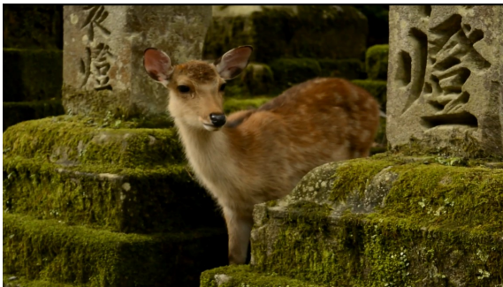
Sacred deer of Nara Park

When returning home, keep in mind that US Customs requires you to declare all purchases acquired abroad. Therefore, be sure to keep the receipts for all the major items you buy. For a more detailed description of what you can and cannot bring back and what it might cost you, visit their website at https://www.cbp.gov/travel/us-citizens/know-before-you-go .