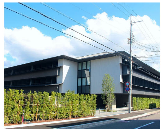
Front view of the Keishiryō – our housing facility.