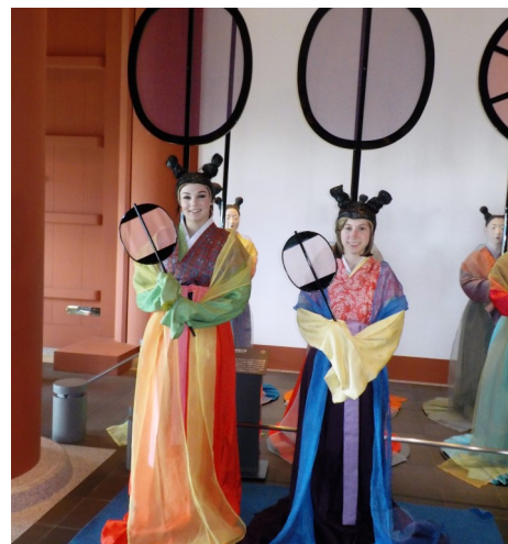
Trying on period costumes in the Osaka History Museum