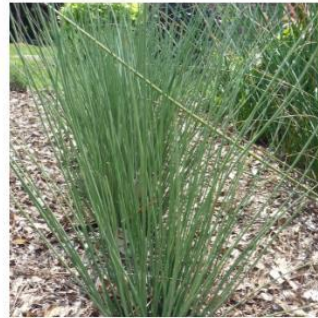
BLUE ARROW JUNCUS