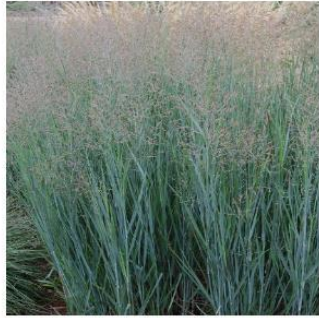
SWITCH GRASS 'HEAVY METAL'

These grasses feature a green understory layer which is outgrown by pink-purple flowers that have a feather-like quality.