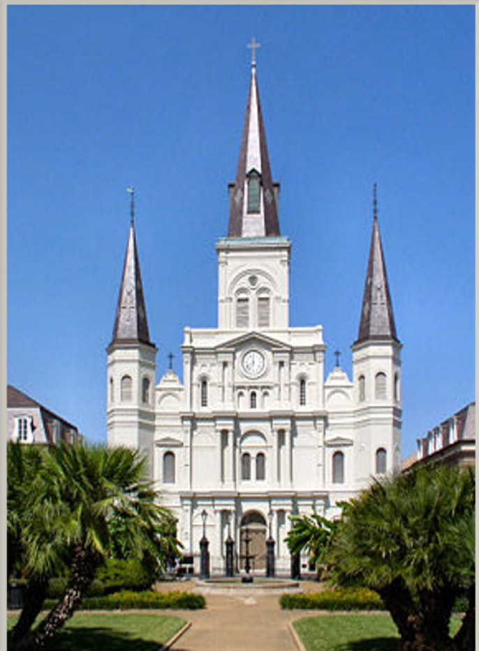
St. Louis Cathedral, New Orleans