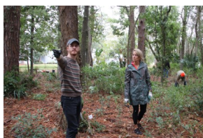
Clean up crew! November 12, 2022