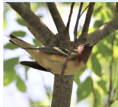
Bay Breasted Warbler - April 26, 2023