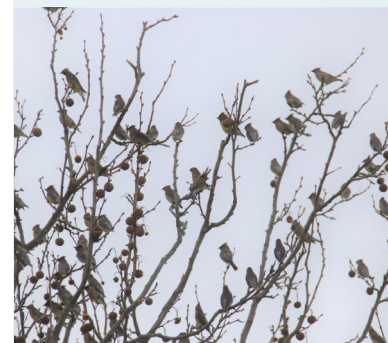
Cedar Waxwings - February 8, 2023