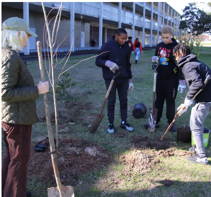
TRiO Upward Bound Students participate in a tree planting event on January 28, 2023.