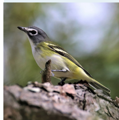
Blue-headed Vireo - November 9, 2022