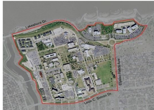
Lakefront Main Campus