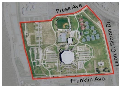
East Campus – Lakefront Arena