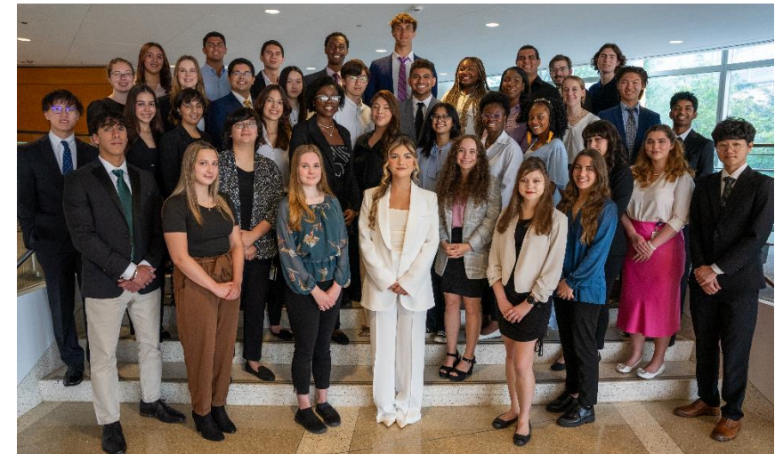
2023 Summer Undergraduate Research