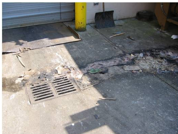
Debris can clog exterior drains like the one shown above, and possibly result in water damage.

Check downspout outlets to ensure that they are not blocked by debris or by the ground itself. It is best to have the surrounding terrain slope away from your building to prevent storm water runoff from accumulating around perimeter walls. Keep all exterior storm water drains free of debris. Drainage canals and culverts that are designed to shed water from the property should be checked and maintained for proper water flow.