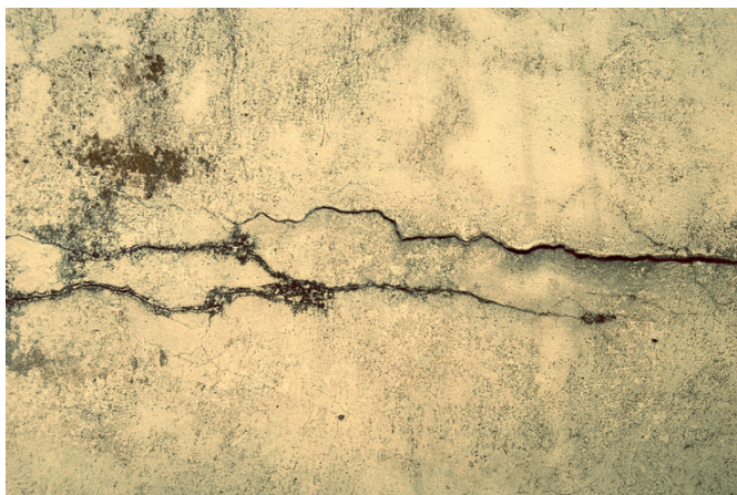
Inspect your walls for cracks caused by water damage, as shown above.

Inspect for and seal all minor wall cracks. Masonry walls may have settling cracks, which often look like steps along the grout line and are visible from the outside, even through stucco. Check wooden walls for rotting siding. If needed, remove rotting boards and apply a new coat of paint. Inspect Exterior Insulating Finishing Systems (EIFS) for cracks, chips, holes and other problems, and repair them as needed. Depending upon the type and extent of repair, a professional may be needed to complete the work.